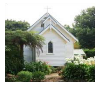
St Matthew's Sunday Service 9.30am Sunday School 9.30am Wednesday 10am 17 Monash Avenue Olinda Victoria 3766