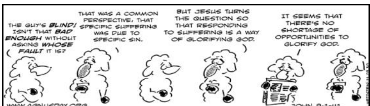
"Agnus Day appears with the permission of www.agnusday.org"

Please bring small posies of flowers to decorate the Easter Cross. Easter Egg Hunt after both services